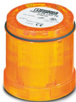
LED permanent light element, 24 V AC/DC, yellow

Please be informed that the data shown in this PDF document is generated from our online catalog. Please find the complete data in the user documentation. Our general terms of use for downloads are valid.