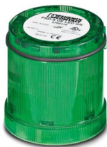
LED permanent light element, 24 V AC/DC, green

Please be informed that the data shown in this PDF document is generated from our online catalog. Please find the complete data in the user documentation. Our general terms of use for downloads are valid.