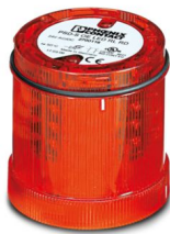
LED rotating light element, 24 V AC/DC, red

Please be informed that the data shown in this PDF document is generated from our online catalog. Please find the complete data in the user documentation. Our general terms of use for downloads are valid.