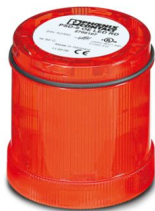
LED permanent light element, 24 V AC/DC, red

Please be informed that the data shown in this PDF document is generated from our online catalog. Please find the complete data in the user documentation. Our general terms of use for downloads are valid.