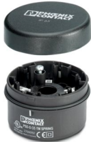
Connection element with spring-cage terminal blocks for tube mounting

Please be informed that the data shown in this PDF document is generated from our online catalog. Please find the complete data in the user documentation. Our general terms of use for downloads are valid.