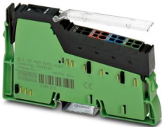
Inline boost terminal for the communications power U_L of 0.8 A, complete with accessories (connectors and labeling field)

Please be informed that the data shown in this PDF document is generated from our online catalog. Please find the complete data in the user documentation. Our general terms of use for downloads are valid.