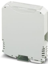
DIN rail housing, Complete housing with metal foot catch, tall design, with vents, width: 22.6 mm, height: 99 mm, depth: 113.65 mm, color: light grey (similar RAL 7035), cross connection: DIN rail connector (optional), number of positions cross connector: 5

Please be informed that the data shown in this PDF document is generated from our online catalog. Please find the complete data in the user documentation. Our general terms of use for downloads are valid.