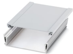
Profile housing, Wall mounting (with accessories as an option), Aluminum profile, 2-piece, profile width (internal): 100.5 mm, profile width (external): 121 mm, length: 150 mm, height: 121 mm, depth: 32.8 mm

Please be informed that the data shown in this PDF document is generated from our online catalog. Please find the complete data in the user documentation. Our general terms of use for downloads are valid.