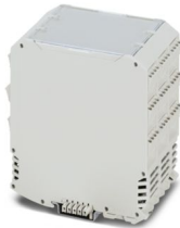
DIN rail housing, Complete housing with metal foot catch, tall design, with vents, width: 67.8 mm, height: 99 mm, depth: 113.65 mm, color: light grey (similar RAL 7035), cross connection: DIN rail connector (optional)

Please be informed that the data shown in this PDF document is generated from our online catalog. Please find the complete data in the user documentation. Our general terms of use for downloads are valid.