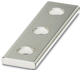
Connection rail, number of positions: 3, color: silver

Please be informed that the data shown in this PDF Document is generated from our Online Catalog. Please find the complete data in the user's documentation. Our General Terms of Use for Downloads are valid ( http://phoenixcontact.com/download )