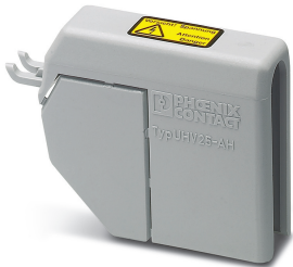
Covering hood, length: 107.2 mm, width: 36.8 mm, height: 65.5 mm, color: gray

Please be informed that the data shown in this PDF Document is generated from our Online Catalog. Please find the complete data in the user's documentation. Our General Terms of Use for Downloads are valid ( http://phoenixcontact.com/download )