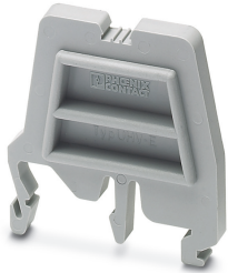
Flange cover, length: 43.3 mm, width: 5.2 mm, color: gray

Please be informed that the data shown in this PDF Document is generated from our Online Catalog. Please find the complete data in the user's documentation. Our General Terms of Use for Downloads are valid ( http://phoenixcontact.com/download )