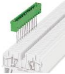
The figure shows a 12-position version

Please be informed that the data shown in this PDF Document is generated from our Online Catalog. Please find the complete data in the user's documentation. Our General Terms of Use for Downloads are valid ( http://phoenixcontact.com/download )