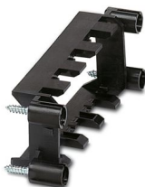
Sleeve frame, Range of articles: VARIOCON, design: VC4, housing material: Polyamide, color: black

Please be informed that the data shown in this PDF document is generated from our online catalog. Please find the complete data in the user documentation. Our general terms of use for downloads are valid.