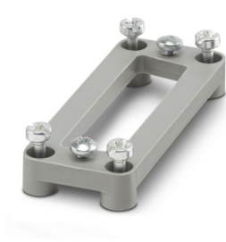
D-SUB adapter plate, for one D-SUB connector, no. of positions 25, housing series HC-D 15...

Please be informed that the data shown in this PDF document is generated from our online catalog. Please find the complete data in the user documentation. Our general terms of use for downloads are valid.