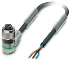
Sensor/actuator cable, 3-position, PUR halogen-free, black-gray RAL 7021, free cable end, on Socket angled M12, coding: A, with 2 LEDs, cable length: 1.5 m

Please be informed that the data shown in this PDF document is generated from our online catalog. Please find the complete data in the user documentation. Our general terms of use for downloads are valid.