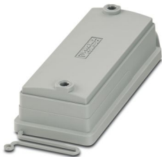
Protective cover B16, with clip locking, protective cover material: PA, height: 31.2 mm, seal: no, with lanyard

Please be informed that the data shown in this PDF document is generated from our online catalog. Please find the complete data in the user documentation. Our general terms of use for downloads are valid.