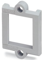
RJ45 panel mounting frame, 1x, IP20, for PCB assembly, for socket inserts, without mounting screws

Please be informed that the data shown in this PDF document is generated from our online catalog. Please find the complete data in the user documentation. Our general terms of use for downloads are valid.