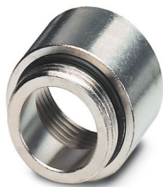
NPT adapter, IP68, up to 5 bar, incl. O-ring seal, M20 to 1/2"

Please be informed that the data shown in this PDF document is generated from our online catalog. Please find the complete data in the user documentation. Our general terms of use for downloads are valid.