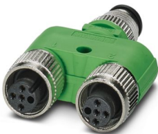
Y distributor, 4-position, Plug straight M12, coding: A, on Socket straight M12, coding: A, PIN 2+4 bridged and Socket straight M12, coding: A, PIN 2+4 bridged

Please be informed that the data shown in this PDF document is generated from our online catalog. Please find the complete data in the user documentation. Our general terms of use for downloads are valid.