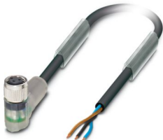
Sensor/actuator cable, 3-position, PUR halogen-free, black-gray RAL 7021, free cable end, on Socket angled M8, coding: A, with 2 LEDs, cable length: 1.5 m

Please be informed that the data shown in this PDF document is generated from our online catalog. Please find the complete data in the user documentation. Our general terms of use for downloads are valid.