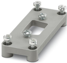
D-SUB adapter plate, for one D-SUB connector, no. of positions 9, housing series HC-D 15...

Please be informed that the data shown in this PDF document is generated from our online catalog. Please find the complete data in the user documentation. Our general terms of use for downloads are valid.