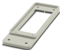
HEAVYCON adapter plate, type B24 on B10, for panel cutouts of type B24, gray

Please be informed that the data shown in this PDF document is generated from our online catalog. Please find the complete data in the user documentation. Our general terms of use for downloads are valid.