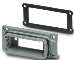
D-SUB panel mounting frame, shell size 1, IP67 degree of protection, black

Please be informed that the data shown in this PDF document is generated from our online catalog. Please find the complete data in the user documentation. Our general terms of use for downloads are valid.