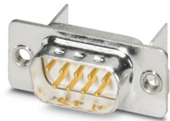
D-SUB contact insert, shell size 1, with nine signal contacts, type of contact pin, for PCB assembly, angled, fixing with a 2.5 mm hole and solder metal plate, for panel mounting frame VS-09-...

Please be informed that the data shown in this PDF document is generated from our online catalog. Please find the complete data in the user documentation. Our general terms of use for downloads are valid.