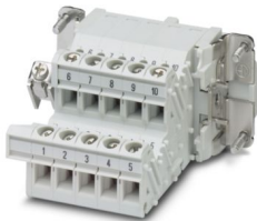
HEAVYCON terminal adapter socket insert, B10 series, 10-pos., for the right side of the control cabinet, screw connection.

Please be informed that the data shown in this PDF document is generated from our online catalog. Please find the complete data in the user documentation. Our general terms of use for downloads are valid.