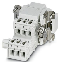
HEAVYCON terminal adapter, pin insert, B6 series, 6-pos., for the left side of the control cabinet, screw connection

Please be informed that the data shown in this PDF document is generated from our online catalog. Please find the complete data in the user documentation. Our general terms of use for downloads are valid.