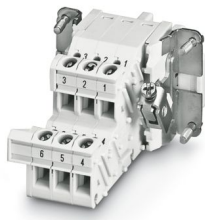
HEAVYCON terminal adapter, socket insert, B6 series, 6-pos., for the left side of the control cabinet, screw connection

Please be informed that the data shown in this PDF document is generated from our online catalog. Please find the complete data in the user documentation. Our general terms of use for downloads are valid.