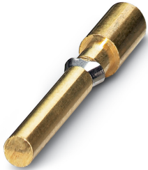
Dummy socket for contact carrier with turned CK 1,6-ED.. female contacts

Please be informed that the data shown in this PDF Document is generated from our Online Catalog. Please find the complete data in the user's documentation. Our General Terms of Use for Downloads are valid ( http://phoenixcontact.com/download )