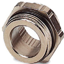
Cable screw connection support Pg16/M25, metal; for thread M25 and rubber seals of size Pg16

Please be informed that the data shown in this PDF document is generated from our online catalog. Please find the complete data in the user documentation. Our general terms of use for downloads are valid.