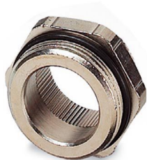
Cable gland for Pg21 half screw connection to M32 housing entry, metal

Please be informed that the data shown in this PDF document is generated from our online catalog. Please find the complete data in the user documentation. Our general terms of use for downloads are valid.