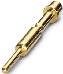
Crimp contact, turned, Single contact, contact diameter: 1 mm, crimp range: 0.34 mm 2 ... 0.5 mm 2

Please be informed that the data shown in this PDF Document is generated from our Online Catalog. Please find the complete data in the user's documentation. Our General Terms of Use for Downloads are valid ( http://phoenixcontact.com/download )