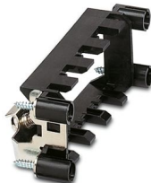
Sleeve frame, Range of articles: VARIOCON, design: VC1, housing material: Polyamide, color: black

Please be informed that the data shown in this PDF document is generated from our online catalog. Please find the complete data in the user documentation. Our general terms of use for downloads are valid.