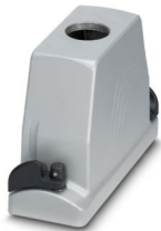
HEAVYCON ADVANCE EMV sleeve housing B16, with bayonet locking, height 100 mm, with 1x M40 thread, straight cable outlet

Please be informed that the data shown in this PDF document is generated from our online catalog. Please find the complete data in the user documentation. Our general terms of use for downloads are valid.