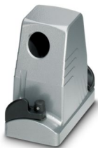
HEAVYCON ADVANCE standard powder-coated, sleeve housing B10, with bayonet locking, height 100 mm, with 1xM25 thread, lateral cable outlet

Please be informed that the data shown in this PDF document is generated from our online catalog. Please find the complete data in the user documentation. Our general terms of use for downloads are valid.