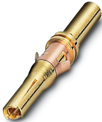
Crimp contact, turned, contact diameter: 1 mm, crimp range: 0.25 mm 2 ... 0.5 mm 2

Please be informed that the data shown in this PDF Document is generated from our Online Catalog. Please find the complete data in the user's documentation. Our General Terms of Use for Downloads are valid ( http://phoenixcontact.com/download )