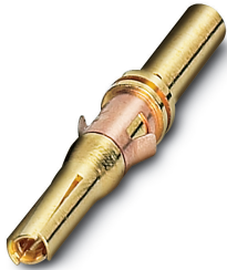
Crimp contact, turned, contact diameter: 1 mm, crimp range: 0.14 mm 2 ... 0.75 mm 2

Please be informed that the data shown in this PDF Document is generated from our Online Catalog. Please find the complete data in the user's documentation. Our General Terms of Use for Downloads are valid ( http://phoenixcontact.com/download )