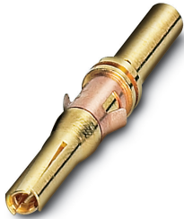
Crimp contact, turned, contact diameter: 1.5 mm, crimp range: 0.75 mm 2 ... 1 mm 2

Please be informed that the data shown in this PDF Document is generated from our Online Catalog. Please find the complete data in the user's documentation. Our General Terms of Use for Downloads are valid ( http://phoenixcontact.com/download )