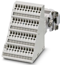
HEAVYCON terminal adapter male insert, D40 series, 40-pos., right PE connection for the left side of the control cabinet, screw connection

Please be informed that the data shown in this PDF document is generated from our online catalog. Please find the complete data in the user documentation. Our general terms of use for downloads are valid.