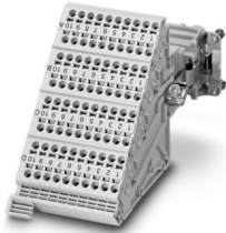
HEAVYCON terminal adapter female insert, D40 series, 40-pos., right PE connection for the left side of the control cabinet, push-in connection

Please be informed that the data shown in this PDF document is generated from our online catalog. Please find the complete data in the user documentation. Our general terms of use for downloads are valid.