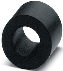
Insert seal for QUICKON T-distributor, for IP65 sealing of thin power conductors (10 - 12.5 mm)

Please be informed that the data shown in this PDF Document is generated from our Online Catalog. Please find the complete data in the user's documentation. Our General Terms of Use for Downloads are valid ( http://phoenixcontact.com/download )