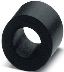
Insert seal for QUICKON T-distributor, for IP65 sealing of thin power conductors (9 - 11 mm)

Please be informed that the data shown in this PDF Document is generated from our Online Catalog. Please find the complete data in the user's documentation. Our General Terms of Use for Downloads are valid ( http://phoenixcontact.com/download )