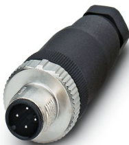
Connector, Universal, 4-position, Plug straight M12 SPEEDCON, coding: A, Screw connection, knurl material: Zinc die-cast, nickel-plated, cable gland Pg7, external cable diameter 4 mm ... 6 mm

Please be informed that the data shown in this PDF document is generated from our online catalog. Please find the complete data in the user documentation. Our general terms of use for downloads are valid.