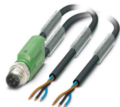
Sensor/actuator cable, 3-position, PUR halogen-free, black-gray RAL 7021, Plug straight M12 SPEEDCON, coding: A, on free cable end and free cable end, cable length: 3 m

Please be informed that the data shown in this PDF document is generated from our online catalog. Please find the complete data in the user documentation. Our general terms of use for downloads are valid.