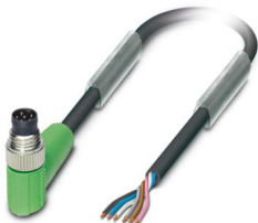
Sensor/actuator cable, 6-position, PUR halogen-free, black-gray RAL 7021, Plug angled M8, coding: A, on free cable end, cable length: 1.5 m

Please be informed that the data shown in this PDF document is generated from our online catalog. Please find the complete data in the user documentation. Our general terms of use for downloads are valid.