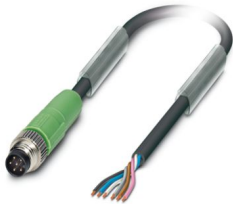
Sensor/actuator cable, 6-position, PUR halogen-free, black-gray RAL 7021, Plug straight M8, coding: A, on free cable end, cable length: 5 m

Please be informed that the data shown in this PDF document is generated from our online catalog. Please find the complete data in the user documentation. Our general terms of use for downloads are valid.