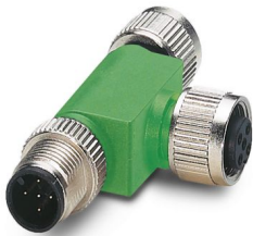
T distributor, 5-position, Plug straight M12, coding: A, on Socket straight M12, coding: A, PIN 2+4 bridged and Socket straight M12, coding: A, PIN 2+4 bridged

Please be informed that the data shown in this PDF document is generated from our online catalog. Please find the complete data in the user documentation. Our general terms of use for downloads are valid.