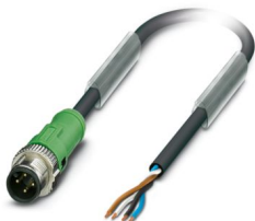
Sensor/actuator cable, 4-position, PUR halogen-free, black-gray RAL 7021, Plug straight M12 SPEEDCON, coding: A, on free cable end, cable length: 3 m

Please be informed that the data shown in this PDF document is generated from our online catalog. Please find the complete data in the user documentation. Our general terms of use for downloads are valid.