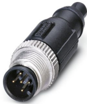
Terminating resistor CANopen ® /DeviceNet ™ M12

Please be informed that the data shown in this PDF document is generated from our online catalog. Please find the complete data in the user documentation. Our general terms of use for downloads are valid.