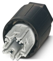
QUICKON nut, black, 4+PE-pos., 1.0 mm 2 ... 2.5 mm 2 /690 V/20 A, for cables with 6 mm ... 11 mm diameter.

Please be informed that the data shown in this PDF document is generated from our online catalog. Please find the complete data in the user documentation. Our general terms of use for downloads are valid.